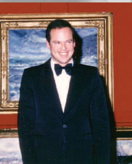
Artistic Director of Concerts at Sotheby's London 1986-96