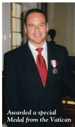
Awarded a special Medal from the Vatican