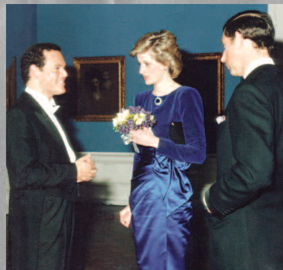
The Prince and Princess of Wales