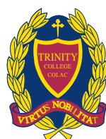
TRINITY COLLEGE COLAC