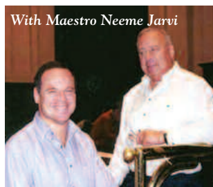
With Maestro Neeme Jarvi