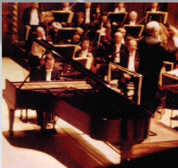
Detroit Symphony Orchestra